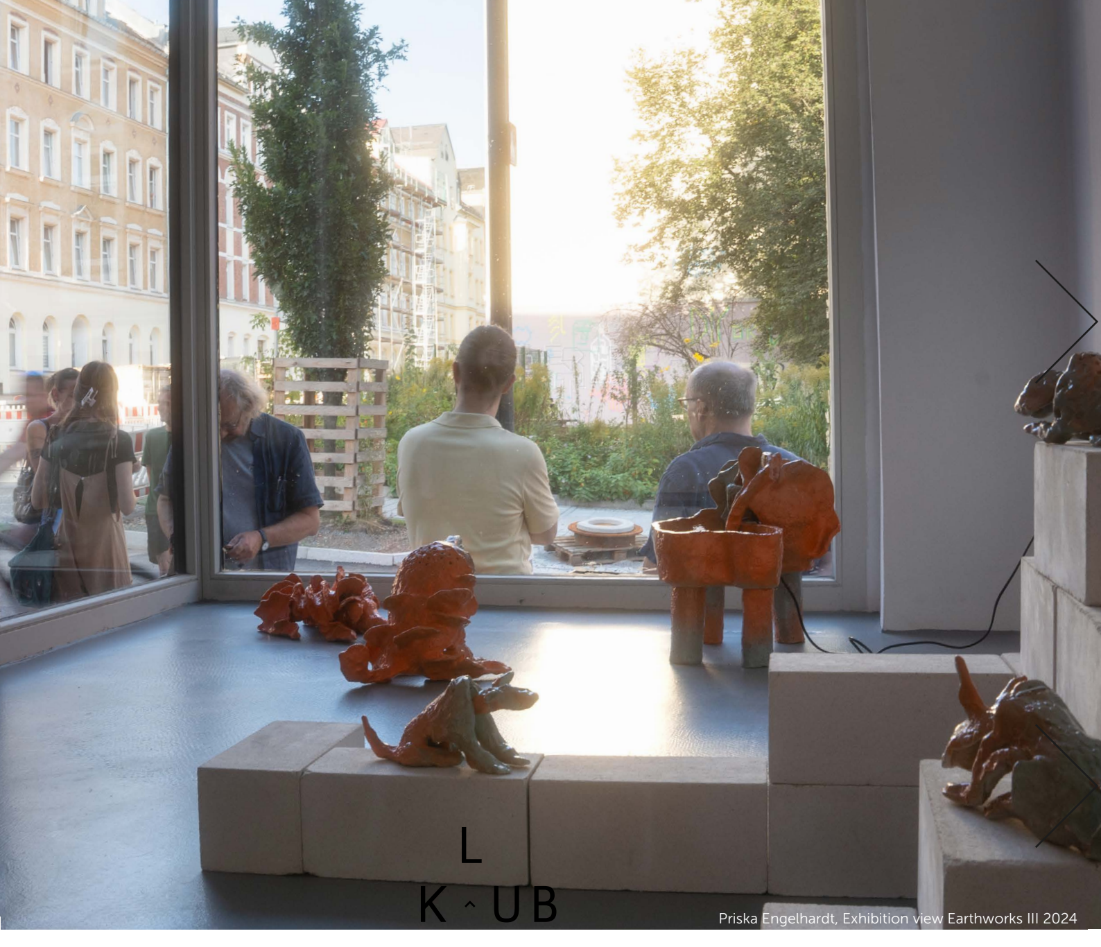
SOLI - AER T

Informations on artistic residency Chemnitz 2025 Klub Solitaer e.V.